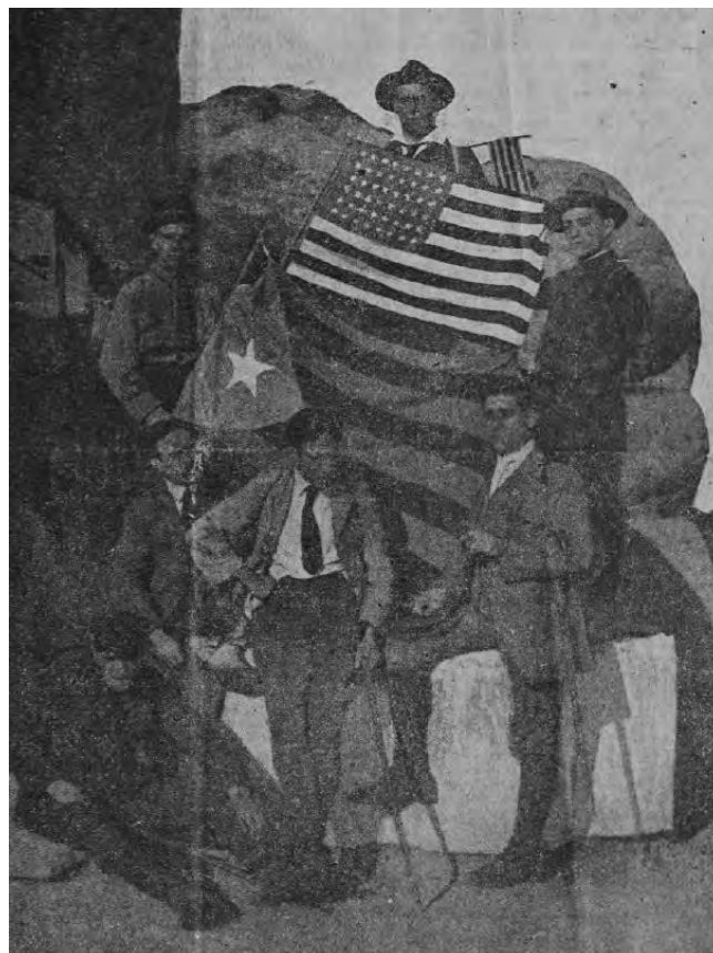
Figure 8. First photograph of the old flag of Estat Català. It is being exhibited by Catalan and North American hikers on Montserrat (1918). It was inspired by the Cuban and American flags and added the blue triangle (humanity) and the republican star above the four stripes of the Catalan flag.

After this political fracas, a notably harsh class struggle began in industrial Catalonia characterised by the proliferation of social attacks, which had started earlier. In Barcelona, they were the years of the thuggery called pistolisme . The first Catalan pro-independence political organisation also appeared in 1919, led by MP Francesc Macià; initially it met little success in the elections. 14