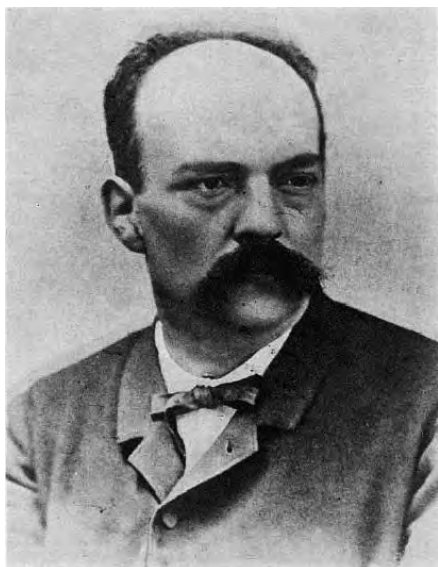
Figure 1. Valentí Almirall. His models included the Swiss Confederation and the United States of America, but he accepted the solution of the Catalan claims within a composite monarchy in the style of the Austro-Hungarian Empire.

aimed to overcome the struggle between Catholic fanaticism and anti-clericalism after three civil wars, the Carlist wars. The last one had just ended in Catalonia in 1875 with the military defeat of the anti-liberal traditionalists who had risen up in 1872.