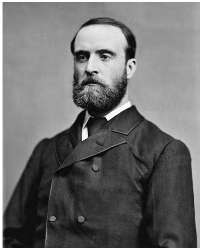
Figure 2. Charles Stewart Parnell, the Irish nationalist leader who was sent a message of solidarity and homage from Barcelona.

The Catalanist newspaper L'Arc de Sant Martí issued an appeal to sign a congratulatory message for Parnell in 1886, and in 1887 it published an extraordinary issue entitled Catalunya a Irlanda (Catalonia to Ireland). A total of 2,886 individuals signed it, which surged to 6,000 by 1887. 2 The broad swath of society that they represented is surprising: 272 signatories identified themselves as blue-