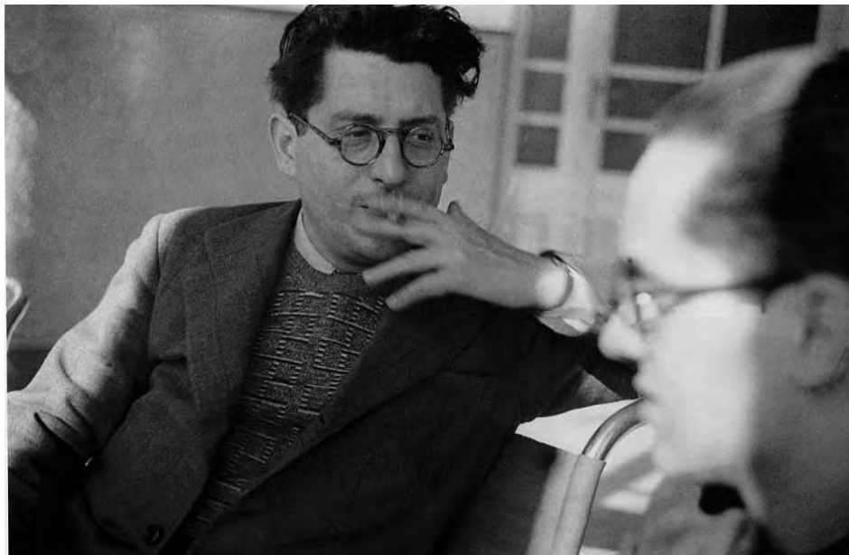
Figure 10. Andreu Nin, author of a Marxist formula for national emancipation.

plans, the progress of instruction and the morale of austerity. He recognised that the people lived under a dictatorship dominated by Stalin.