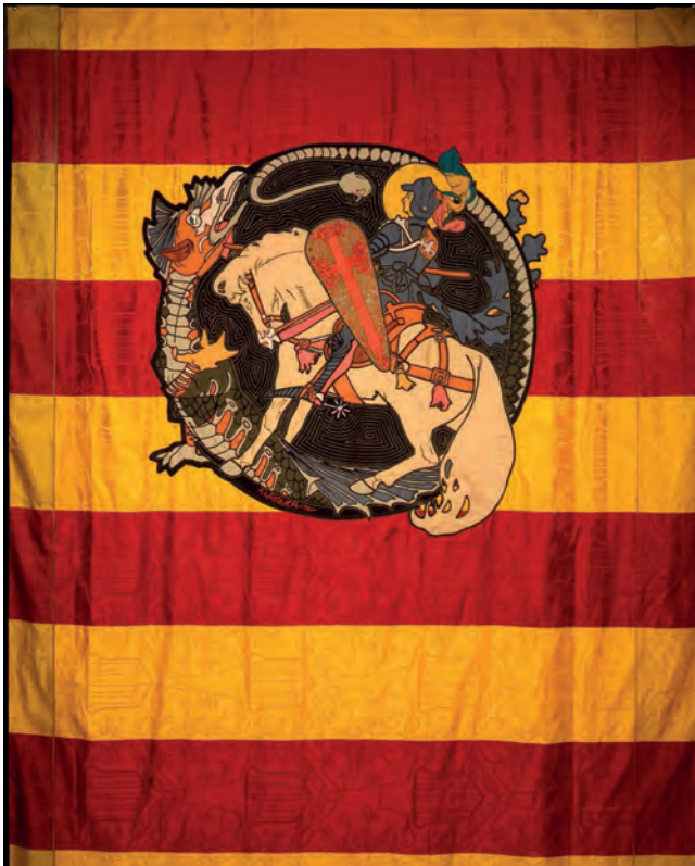
Figure 3. Flag of the Unió Catalanista featuring Saint George, the patron saint of Catalonia, slaying the dragon portrayed in a Modernista aesthetic.

subversive paragraph of the message said that if Catalonia had a vote in the concert of peoples, it would take Greece's side because "we know all too well, to our own misfortune, what foreign domination is, to never countenance it again wherever it is, regardless of whether it affects Turks or Christians". The Orfeo Català and the Catalunya Nova choir closed the event with their singing. Eighteen magazines and 28 Catalanist organisations joined the affair, and several European newspapers reported on it. 3