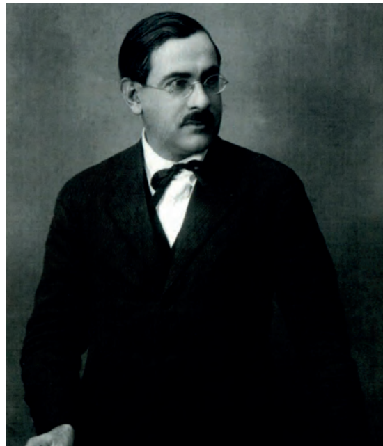
Figure 4. Antoni Rovira i Virgili, ideologue of Catalan republican nationalism.

In 1912, the author of the prologue of Rovira i Virgili's book was the jurist, economist and politician Pere Coromines, the leader of the party to which Rovira belonged at the time, the Unió Federal Nacionalista Republicana (Republican Nationalist Federal Union). Coromines stressed two conclusions from a book that aimed to be descriptive and avoid theorising. The first was that generalising on the criteria that define nationalities had to be avoided, given that each one evolves in its own specific way. The second conclusion was that "the dramatic episode of the nationalities is part of the evolution of the State in Europe". Coromines noted that there had been a shift from citizens' rights to nations' rights.