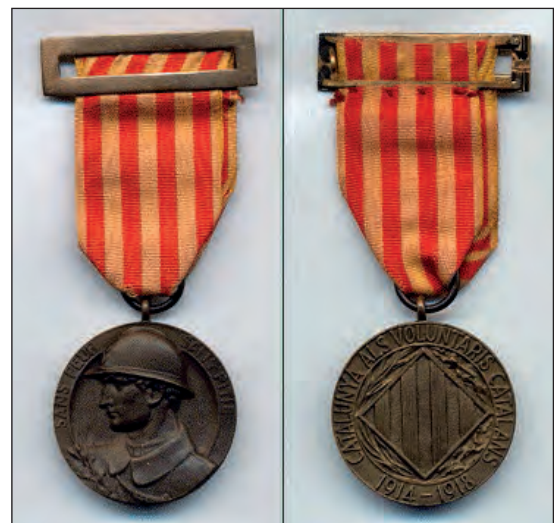
Figure 6. Medals for the Catalan volunteers in the French army during World War I.

Almost 1,000 Catalan volunteers fought with the French Foreign Legion, a figure below the legendary 12,000 that circulated back then yet comparable to the number of Garibaldi Italians, Poles and Czechs, and much higher than the total of 2,500 volunteers from the rest of Spain. Leaders of the Unió Catalanista created the Comité de Germanor amb els Voluntaris Catalans (Brotherhood Committee with the Catalan Volunteers). 12 The most nationalistic cell of those Catalan volunteers considered itself the valid representation of Catalonia at the Paris Peace Conference. The Fourteen Points for Peace set forth by United States President Woodrow Wilson, who had justified the US's intervention in the war after 1917, seemed to confirm that hope since they included nationalities' right