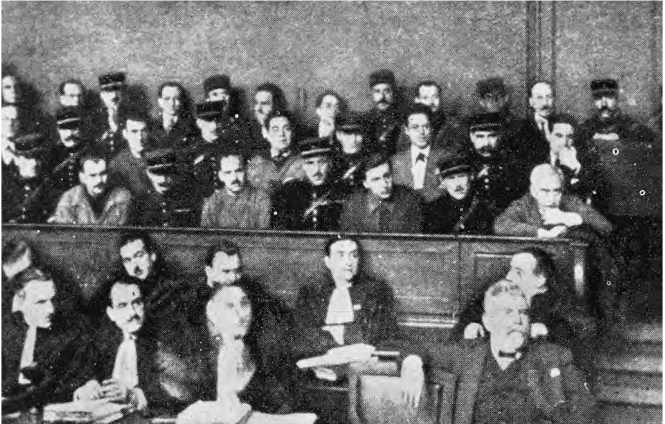
Figure 9. Francesc Macià, resting his head on his hands on the far right, on the defendants' bench of those accused in the Paris trial after their arrest in Prats de Molló.

the words: "Tell the Catalans that we are the most fervent supporters of their independence."