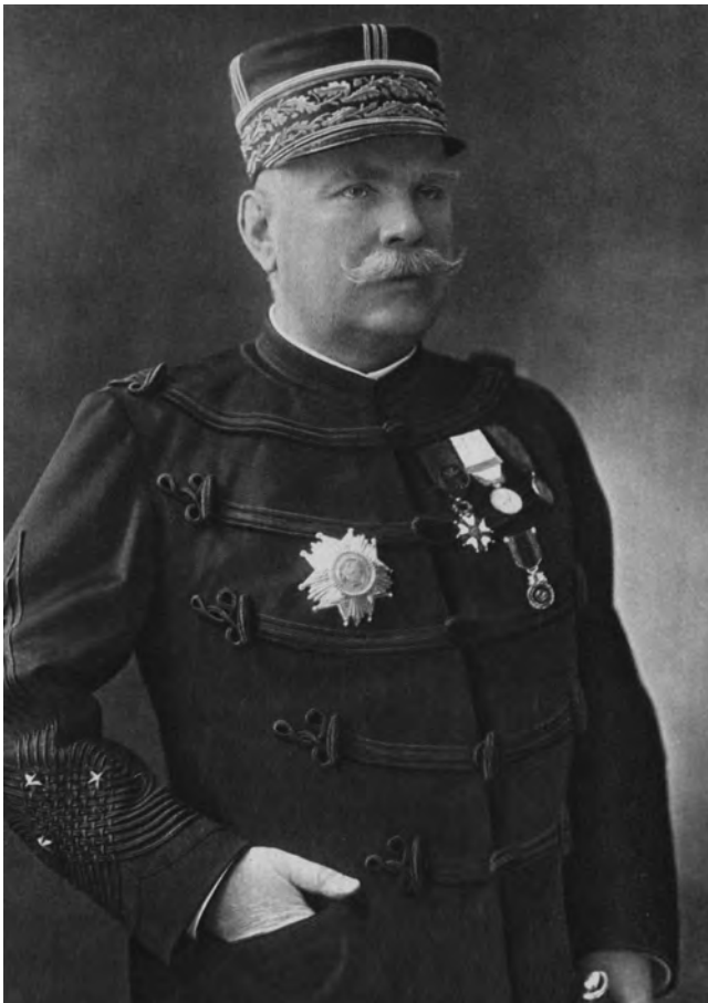
Figure 5. Marshall Joffre. The Catalan nationalists adopted him as a Catalan hero because he was born in Roussillon. He presided over the Jocs Florals in Barcelona in May 1920.

A more complex position was the one that inspired the active neutralism of the Manifest dels Amics de la Unitat Moral d'Europa (Manifesto of Friends of the Moral Unity of Europe) written by Eugeni d'Ors and signed by a significant number of Catalan intellectuals of diverse ideologies, from conservatives like Miquel dels Sants Oliver and Ramon Rucabado to leftists like Andreu Nin, Rafael Campalans and Salvat-Papasseit. Published in December 1914, it repudiated the war as a "European civil war" which had to end in a reconciliation of the values of European unity represented by France and Germany rekindled by classical Mediterraneanism. The interplay of freedom with authority, of democracy with the strong intervening state, had to emerge from the war. The French version of the Catalan Manifesto of Friends of the Moral Unity of Europe was published by Romain Rolland in the Journal de Genève on the 9th of January 1915, a fact which made the international headlines. There was an outcry against the manifesto in both France and Germany and in Catalonia itself. 10